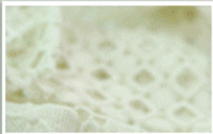
Lace & embroidery / linen / ramie