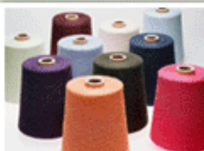
Yarns & fibres